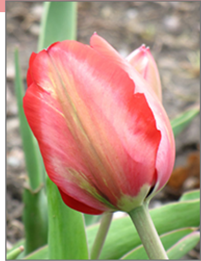
Menton Tulip flowers