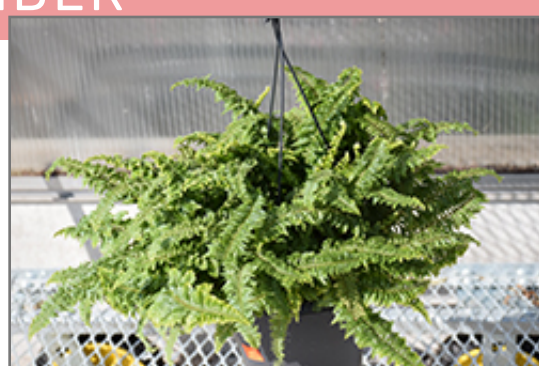
Fluffy Ruffles Boston Fern in full