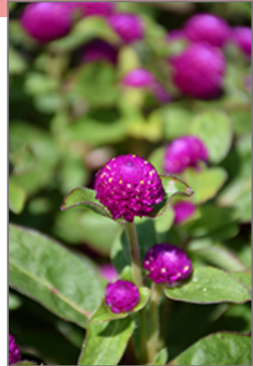
Gnome Purple Gomphrena flowers

Gnome Purple Gomphrena is recommended for the following landscape applications;