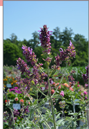
Lancelot Canary Island Sage flowers

Lancelot Canary Island Sage is an herbaceous annual with an upright spreading habit of growth. Its relatively fine texture sets it apart from other garden plants with less refined foliage.