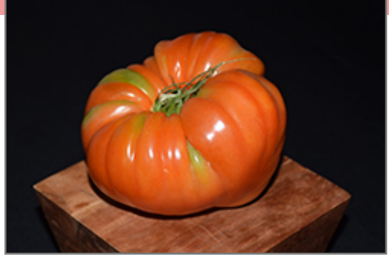
German Giant Tomato fruit

German Giant Tomato will grow to be about 5 feet tall at maturity, with a spread of 24 inches. When planted in rows, individual plants should be spaced approximately 24 inches apart. Because of its vigorous growth habit, it may require staking or supplemental support. This fast-growing vegetable plant is an annual, which means that it will grow for one season in your garden and then die after producing a crop.