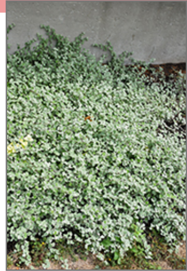
Silver Licorice Plant

Silver Licorice Plant is a fine choice for the garden, but it is also a good selection for planting in outdoor containers and hanging baskets. Because of its trailing habit of growth, it is ideally suited for use as a 'spiller' in the 'spiller-thriller-filler' container combination; plant it near the edges where it can spill gracefully over the pot. Note that when growing plants in outdoor containers and baskets, they may require more frequent waterings than they would in the yard or garden.