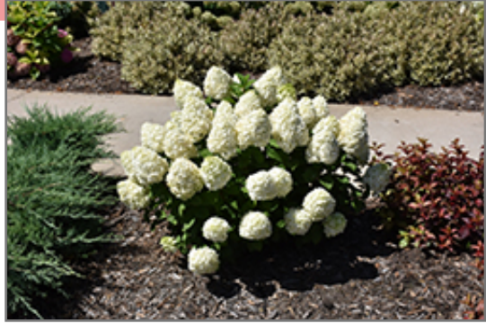
Little Lime Punch Hydrangea in bloom

Little Lime Punch Hydrangea makes a fine choice for the outdoor landscape, but it is also well-suited for use in outdoor pots and containers. With its upright habit of growth, it is best suited for use as a 'thriller' in the 'spiller-thriller-filler' container combination; plant it near the center of the pot, surrounded by smaller plants and those that spill over the edges. It is even sizeable enough that it can be grown alone in a suitable container. Note that when grown in a container, it may not perform exactly as indicated on the tag - this is to be expected. Also note that when growing plants in outdoor containers and baskets, they may require more frequent waterings than they would in the yard or garden.