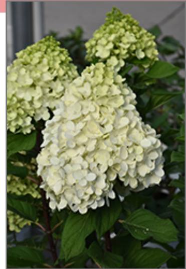
Little Lime Punch Hydrangea flowers