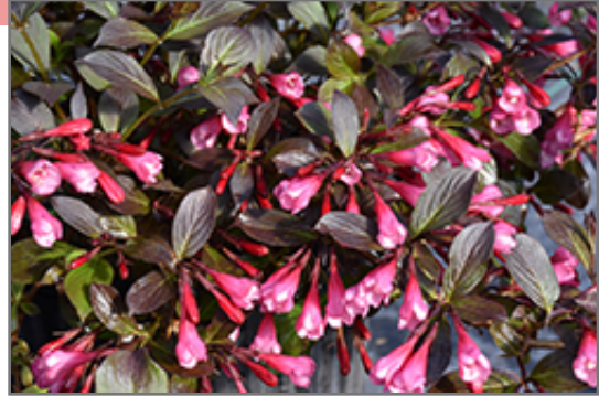
Very Fine Wine Weigela flowers