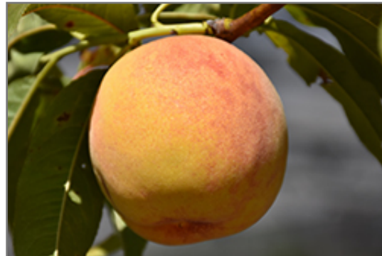
Reliance Peach fruit

Reliance Peach is clothed in stunning clusters of fragrant pink flowers along the branches in early spring, which emerge from distinctive rose flower buds before the leaves. It has dark green foliage throughout the season. The narrow leaves turn yellow in fall. The fruits are showy yellow drupes with a red blush, which are carried in abundance in mid summer. The fruit can be messy if allowed to drop on the lawn or walkways, and may require occasional clean-up.