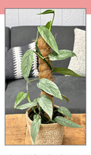
Beautifall Cebu Blue Pothos in full

When grown indoors, Beautifall Cebu Blue Pothos can be expected to grow to be about 9 feet tall at maturity, with a spread of 24 inches. It grows at a fast rate, and under ideal conditions can be expected to live for approximately 10 years. This houseplant will do well in a location that gets either direct or indirect sunlight, although it will usually require a more brightly-lit environment than what artificial indoor lighting alone can provide. It does best in average to evenly moist soil, but will not tolerate standing water. The surface of the soil shouldn't be allowed to dry out completely, and so you should expect to water this plant once and possibly even twice each week. Be aware that your particular watering schedule may vary depending on its location in the room, the pot size, plant size and other conditions; if in doubt, ask one of our experts in the store for advice. It will benefit from a regular feeding with a general-purpose fertilizer with every second or third watering. It is not particular as to soil type or pH; an average potting soil should work just fine. Be warned that parts of this plant are known to be toxic to humans and animals, so special care should be exercised if growing it around children and pets.