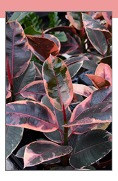
Ruby Rubber Tree foliage

When grown indoors, Ruby Rubber Tree can be expected to grow to be about 8 feet tall at maturity, with a spread of 6 feet. It grows at a medium rate, and under ideal conditions can be expected to live for approximately 50 years. This houseplant will do well in a location that gets either direct or indirect sunlight, although it will usually require a more brightly-lit environment than what artificial indoor lighting alone can provide. It prefers dry to average moisture levels with very well-drained soil, and may die if left in standing water for any length of time. This plant should be watered when the surface of the soil gets dry, and will need watering approximately once each week. Be aware that your particular watering schedule may vary depending on its location in the room, the pot size, plant size and other conditions; if in doubt, ask one of our experts in the store for advice. It will benefit from a regular feeding with a general-purpose fertilizer with every second or third watering. It is not particular as to soil type or pH; an average potting soil should work just fine.