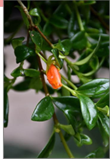
Goldfish Plant flowers

This is a dense herbaceous evergreen houseplant with a trailing habit of growth, eventually spilling over the edges of hanging baskets and containers. This plant can be pruned at any time to keep it looking its best.