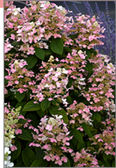
Quick Fire Hydrangea flowers