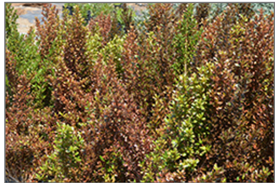
Evening Glow Mirror Bush