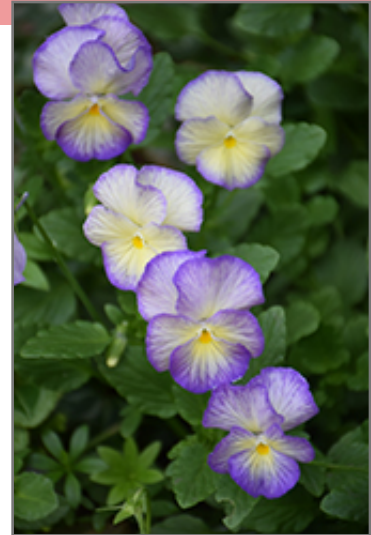
Etain Pansy flowers