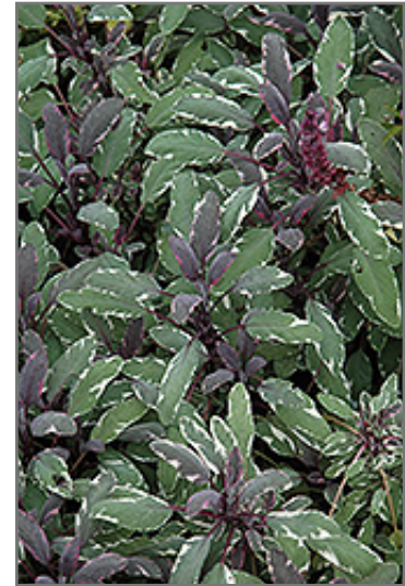
Tricolor Sage foliage