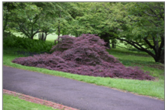
Garnet Cutleaf Japanese Maple