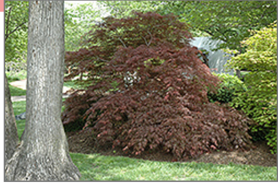
Garnet Cutleaf Japanese Maple

Garnet Cutleaf Japanese Maple will grow to be about 10 feet tall at maturity, with a spread of 8 feet. It has a low canopy with a typical clearance of 1 foot from the ground, and is suitable for planting under power lines. It grows at a fast rate, and under ideal conditions can be expected to live for 60 years or more.