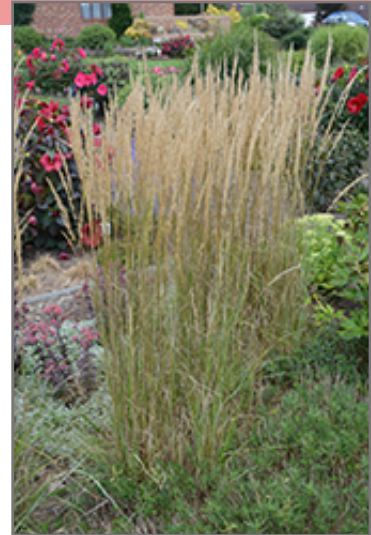
El Dorado Feather Reed Grass

El Dorado Feather Reed Grass is recommended for the following landscape applications;