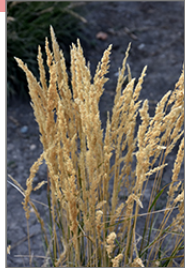
El Dorado Feather Reed Grass fruit

El Dorado Feather Reed Grass is a fine choice for the garden, but it is also a good selection for planting in outdoor pots and containers. Because of its height, it is often used as a 'thriller' in the 'spiller-thriller-filler' container combination; plant it near the center of the pot, surrounded by smaller plants and those that spill over the edges. It is even sizeable enough that it can be grown alone in a suitable container. Note that when growing plants in outdoor containers and baskets, they may require more frequent waterings than they would in the yard or garden.