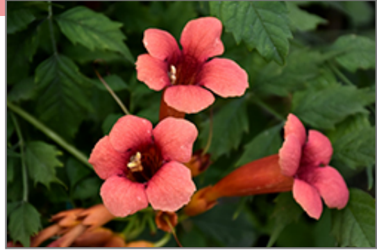
Flamenco Trumpetvine flowers