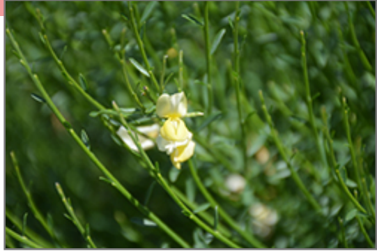
Moonlight Scotch Broom flowers

This shrub should only be grown in full sunlight. It prefers dry to average moisture levels with very well-drained soil, and will often die in standing water. It is considered to be drought-tolerant, and thus makes an ideal choice for xeriscaping or the moisture-conserving landscape. It is particular about its soil conditions, with a strong preference for clay, alkaline soils, and is able to handle environmental salt. It is highly tolerant of urban pollution and will even thrive in inner city environments. This is a selected variety of a species not originally from North America.