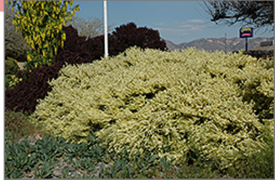
Moonlight Scotch Broom in bloom