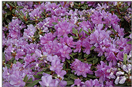
Purple Gem Rhododendron flowers