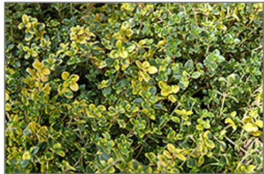
Doone Valley Thyme