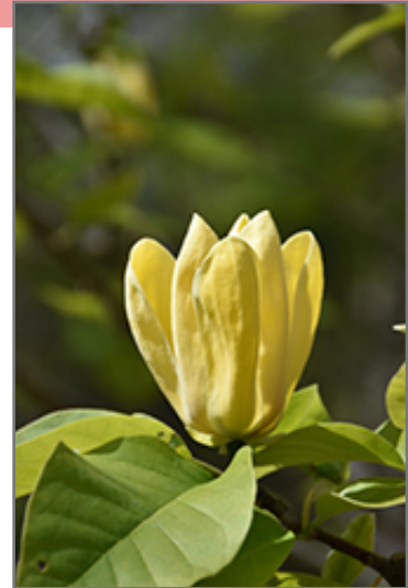
Yellow Bird Magnolia flowers