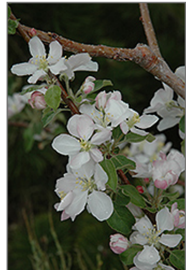
Pink Lady Apple flowers