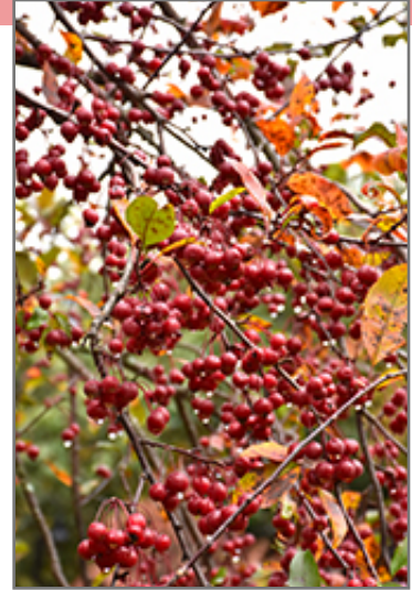
Prairifire Flowering Crab fruit

This tree should only be grown in full sunlight. It prefers to grow in average to moist conditions, and shouldn't be allowed to dry out. It is not particular as to soil type or pH. It is highly tolerant of urban pollution and will even thrive in inner city environments. This particular variety is an interspecific hybrid.