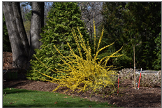
Show Off Forsythia in bloom