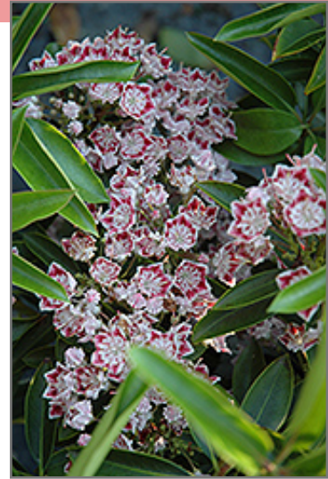
Carousel Mountain Laurel flowers

Carousel Mountain Laurel will grow to be about 10 feet tall at maturity, with a spread of 10 feet. It has a low canopy with a typical clearance of 1 foot from the ground, and is suitable for planting under power lines. It grows at a slow rate, and under ideal conditions can be expected to live for 50 years or more.