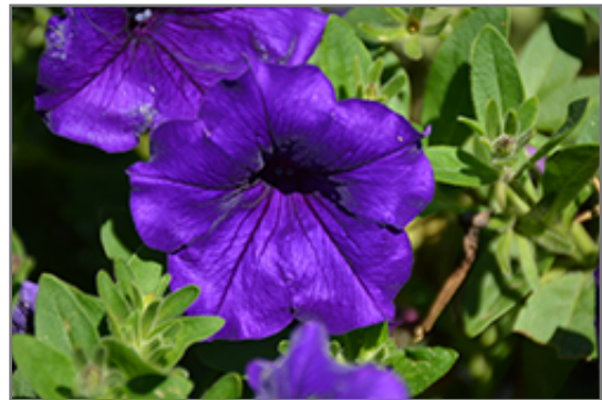
Easy Wave Blue Petunia flowers