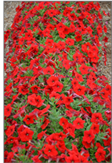
Easy Wave Red Petunia in bloom

Easy Wave Red Petunia is a fine choice for the garden, but it is also a good selection for planting in outdoor containers and hanging baskets. Because of its trailing habit of growth, it is ideally suited for use as a 'spiller' in the 'spiller-thriller-filler' container combination; plant it near the edges where it can spill gracefully over the pot. Note that when growing plants in outdoor containers and baskets, they may require more frequent waterings than they would in the yard or garden.