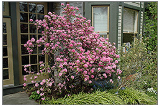
Olga Mezitt Rhododendron in bloom