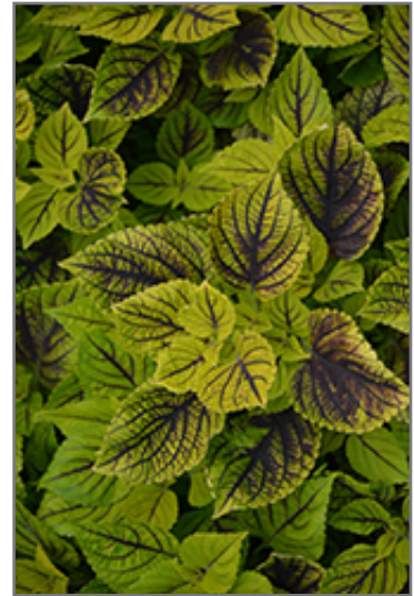
Gays Delight Coleus foliage