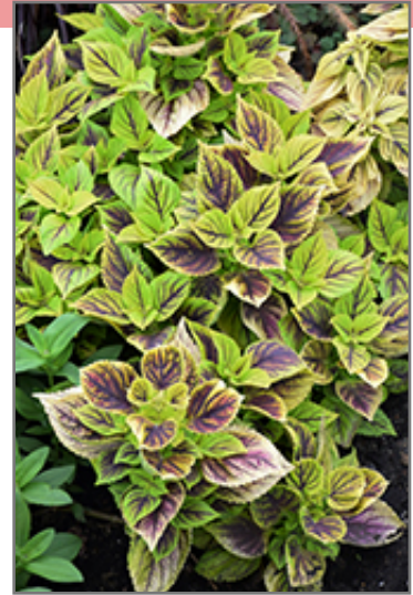
Gays Delight Coleus