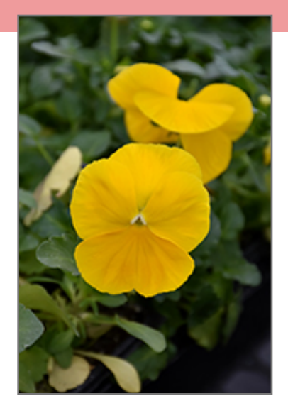
Sorbet XP Yellow Pansy flowers

This plant will require occasional maintenance and upkeep, and should only be pruned after flowering to avoid removing any of the current season's flowers. Deer don't particularly care for this plant and will usually leave it alone in favor of tastier treats. Gardeners should be aware of the following characteristic(s) that may warrant special consideration;