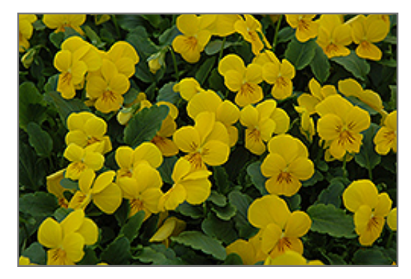
Sorbet XP Yellow Pansy flowers