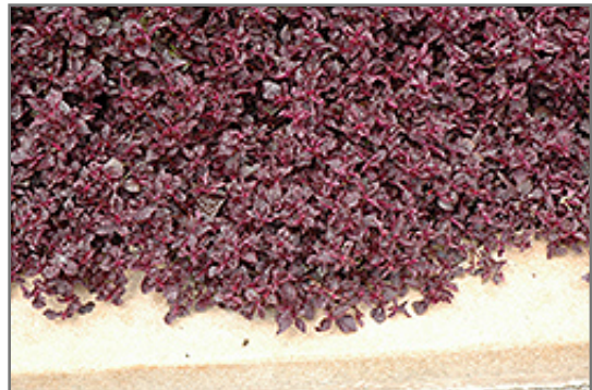
Purple Lady Blood Leaf