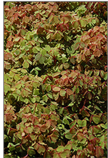
Sunset Velvet Shamrock foliage