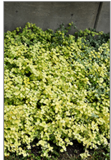
Lemon Licorice Plant