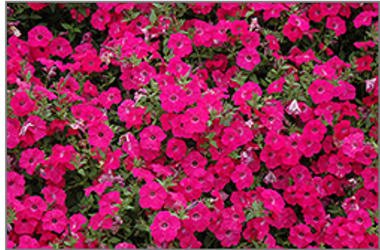
Tidal Wave Hot Pink Petunia in bloom