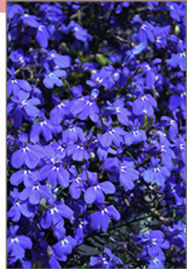
Techno Blue Lobelia flowers

Techno Blue Lobelia is recommended for the following landscape applications;