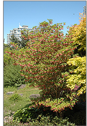
Redvein Enkianthus in bloom