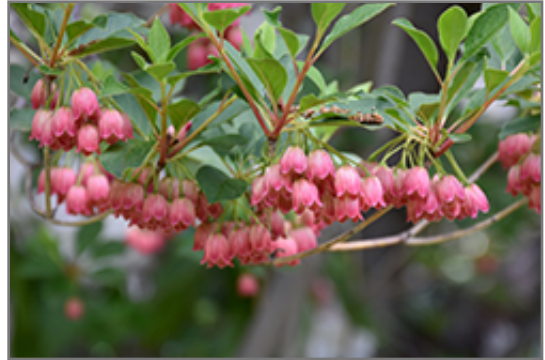
Redvein Enkianthus flowers

Redvein Enkianthus is recommended for the following landscape applications;