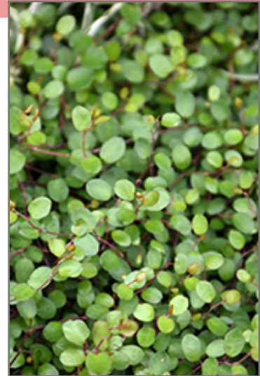
Creeping Wire Vine foliage