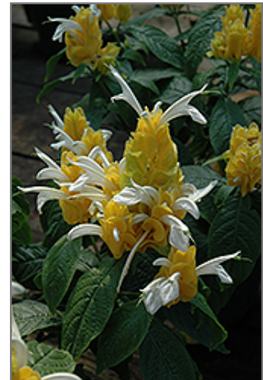
Golden Shrimp Plant flowers