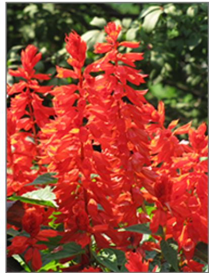
Lighthouse Red Sage flowers