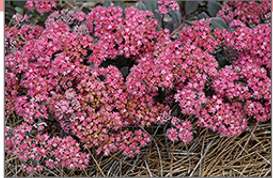
Dazzleberry Stonecrop flowers

Dazzleberry Stonecrop is a dense herbaceous perennial with an upright spreading habit of growth. Its medium texture blends into the garden, but can always be balanced by a couple of finer or coarser plants for an effective composition.