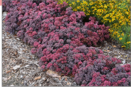
Dazzleberry Stonecrop in bloom