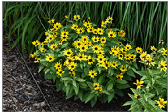
Sunburst False Sunflower in bloom