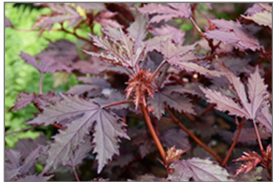
Mahogany Splendor Hibiscus foliage