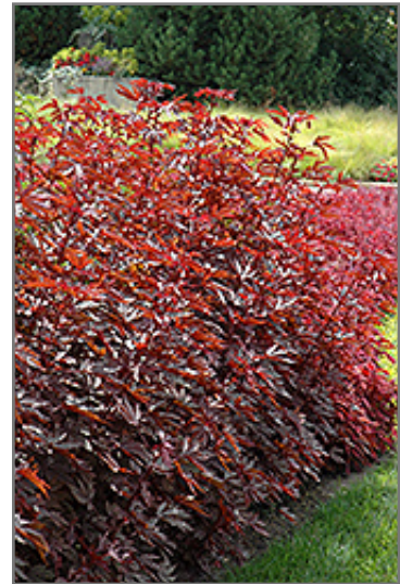
Mahogany Splendor Hibiscus