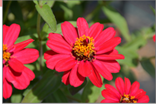
Profusion Double Hot Cherry Zinnia flowers