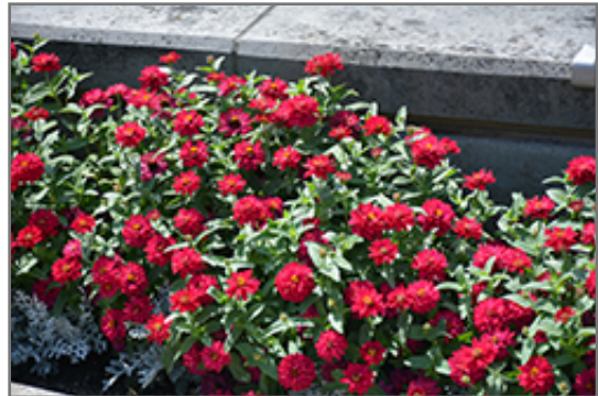
Profusion Double Hot Cherry Zinnia in bloom