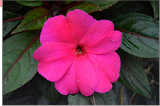
Magnum Blue New Guinea Impatiens flowers

Magnum Blue New Guinea Impatiens is recommended for the following landscape applications;