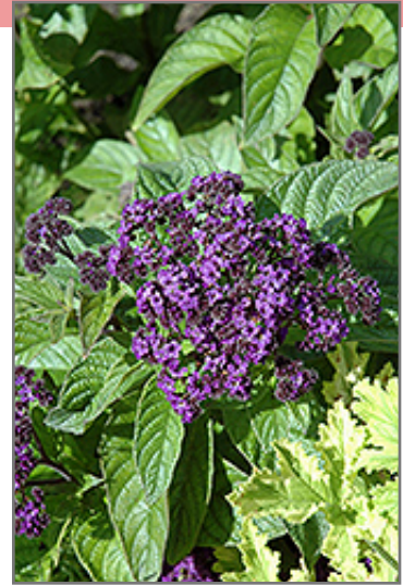
Marine Heliotrope flowers

Beautifully scented, deep purple flower clusters are featured on upright mounded dark green foliage; a heat tolerant variety, excellent in borders, patio containers and hanging baskets; deadhead to encourage new growth throughout the season