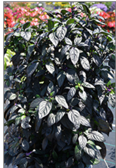
Black Pearl Ornamental Pepper