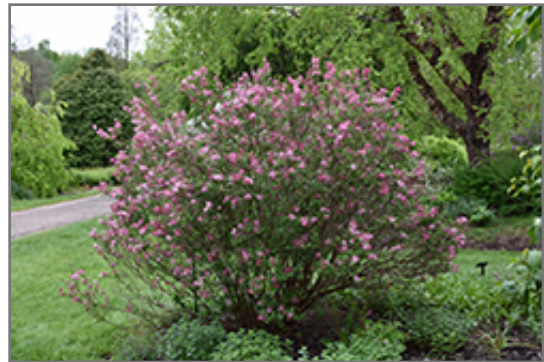
Fairytale Tinkerbelle Lilac in bloom