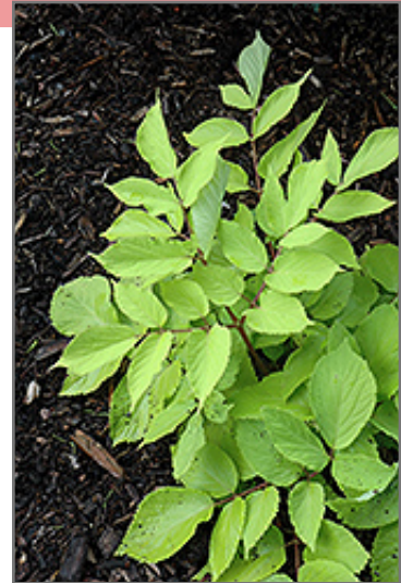
Sun King Japanese Spikenard foliage

This plant performs well in both full sun and full shade. It prefers to grow in average to moist conditions, and shouldn't be allowed to dry out. It is not particular as to soil type or pH. It is highly tolerant of urban pollution and will even thrive in inner city environments. This is a selected variety of a species not originally from North America.