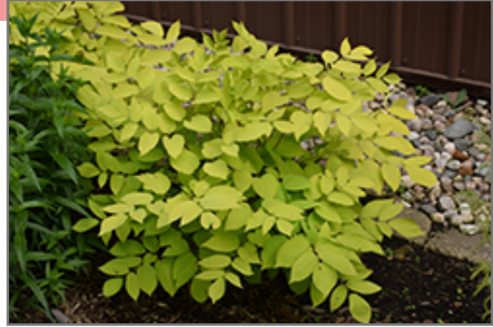
Sun King Japanese Spikenard